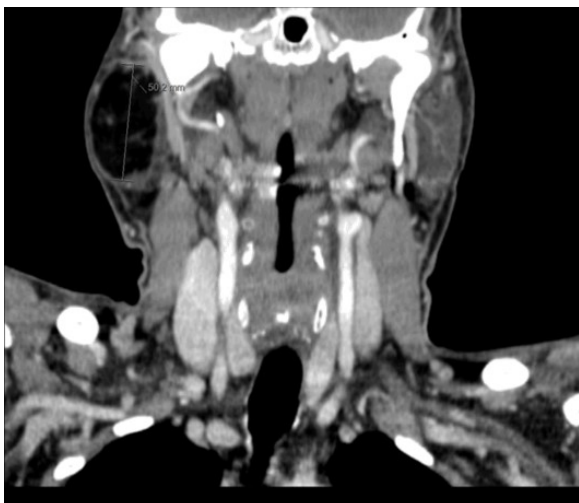
Figure 1: CT scan - Right Parotid Gland Lipoma