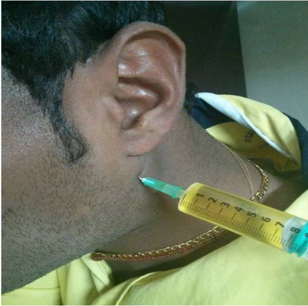
Figure 1: Clinical picture of the swelling on left inferior auricular region