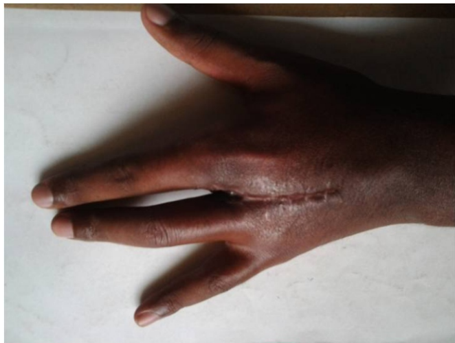
Figure 2: Post operative appearance of the left hand.