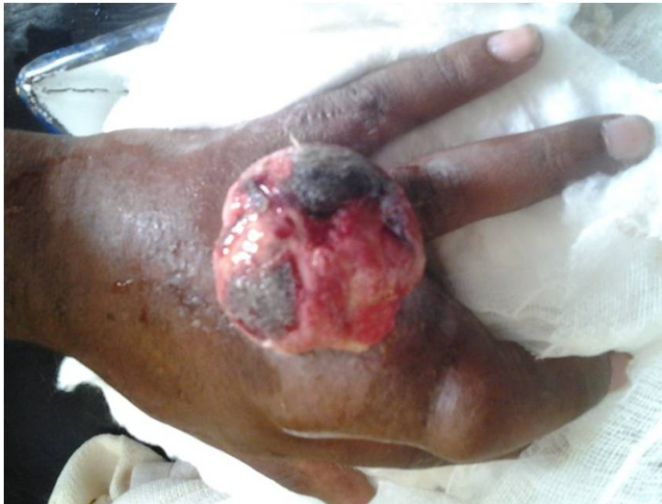
Figure 1: Large exophytic ulcerated mass proximal to the third and fourth web spaces with diffuse swelling and erythema of the proximal phalanx and base of the middle finger.