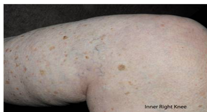
Figure 2(b): Right medial knee after completion of chemotherapy.