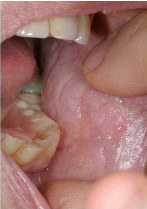
Figure 4(a): Buccal mucosa before chemotherapy.