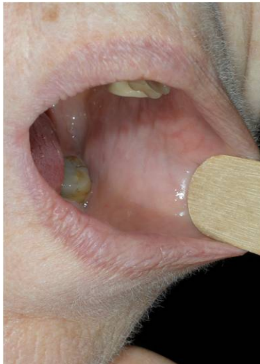
Figure 4(b): Buccal mucosa after completion of chemotherapy.