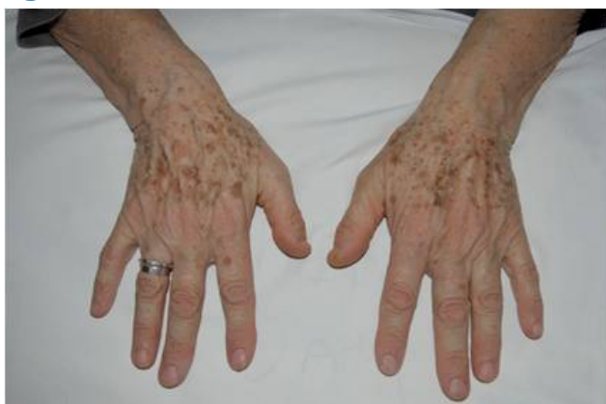
Figure 1(a): Seborrheic keratosis before chemotherapy.