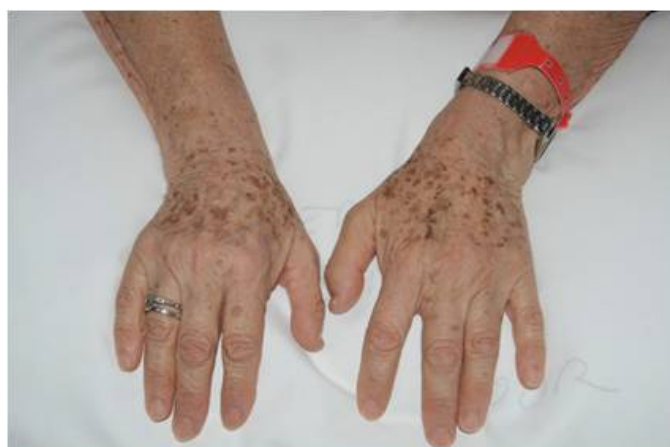
Figure 1(b): Seborrheic keratosis after completion of chemotherapy.