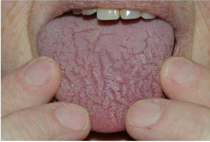
Figure 3(a): Tongue before chemotherapy.