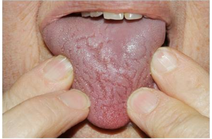
Figure 3(b): Tongue after completion of chemotherapy.