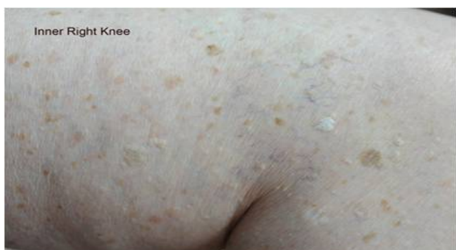
Figure 2(a): Right medial knee before chemotherapy.