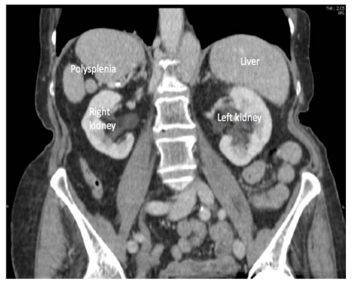
Figure 3: Coronal single slice computed tomography Figure 4: The hepatic veins drain directly into the left left side and there are three spleens on the right side. compared to the left ventricle. The colon is located totally on the right side.