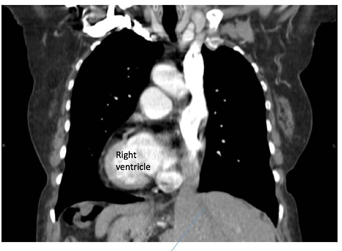
Hepatic vein draining into atrium

through the upper abdomen. The liver is present on the atrium. The right ventricle has a thicker muscular wall