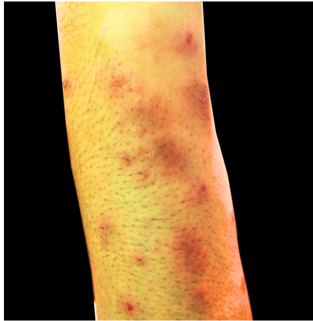
Figure 1: pruritic lesion of PG over arm